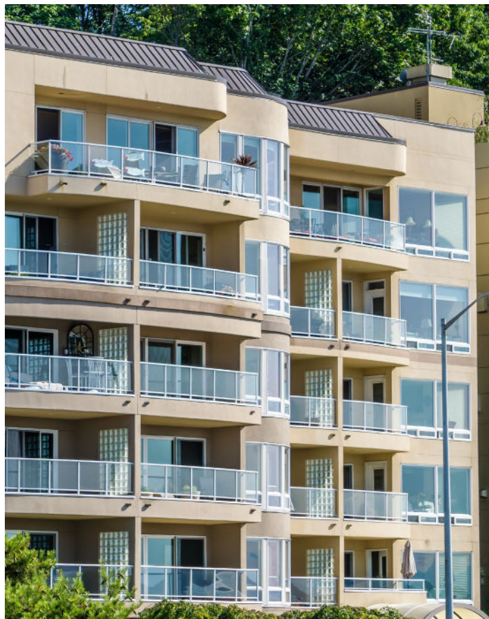
Exhibit 2: Summary of Global Studies of Rent Control

Rent control discourages new construction of rental housing, as developers are less incentivized to invest in projects with capped returns. The uncertainty surrounding future policy changes further exacerbates this issue, leading to a decline in rental housing supply. Some studies noted that this impact may be less severe in cases where new construction is exempt from rent control, but overall development often shifts towards owner-occupied or luxury housing.